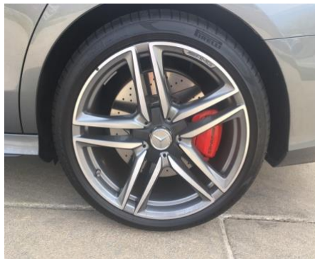
(2) Rear: 295/30ZR20 (101Y) XL