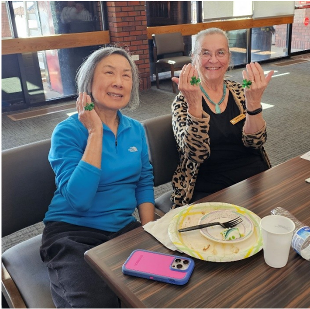
Showing off our shamrock rings.